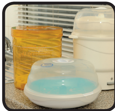
sterilising equipment (such as a cold-water steriliser, microwave or steam steriliser)