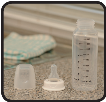
bottles with teats and bottle covers

You need to make sure you clean and sterilise the equipment to prevent your baby from getting infections and stomach upsets. You'll need: