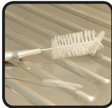
bottle brush, teat brush